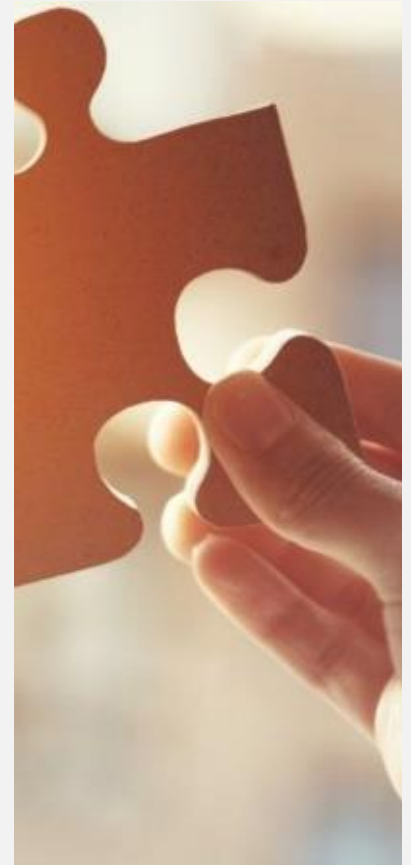
Growth & Stability